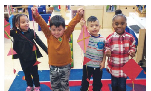
The children at Rockdale Head Start had a great time making and flying kites!