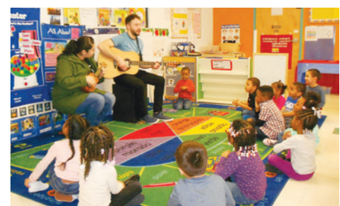
Experiencing live music was a favorite activity in many classrooms during The Week of the Young Child.