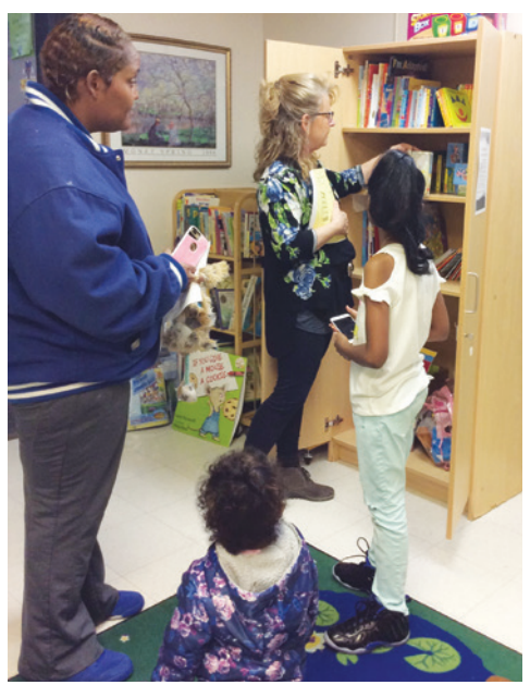
One evening was dedicated to literacy and learning with family. Head Start students and their parents explored the lending library and were introduced to the computer lab. Each family checked out a book or a game to enjoy together!