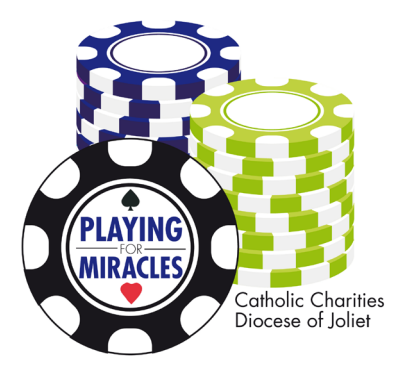
Save the Date Playing for Miracles 2019 November 15